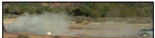
Image 13 – The cloud of powder followed the CVPI all the way through impact until it came to a stop